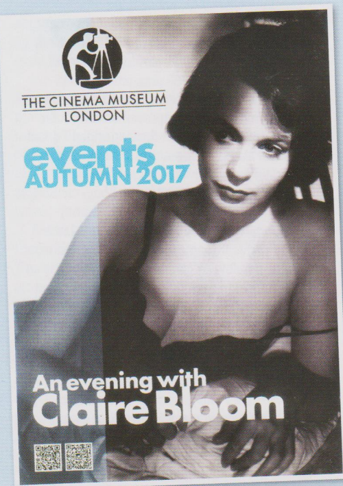
Part of the recent events brochure. Claire Bloom, of course, was selected by Charles Chaplin to co-star in Limelight (1952).