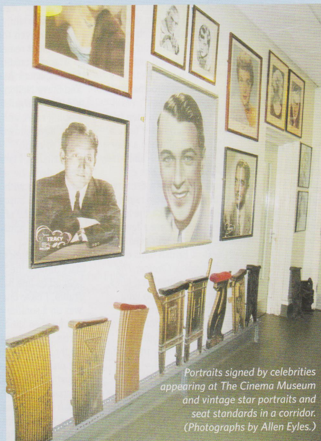
Portraits signed by celebrities appearing at The Cinema Museum and vintage star portraits and seat standards in a corridor.