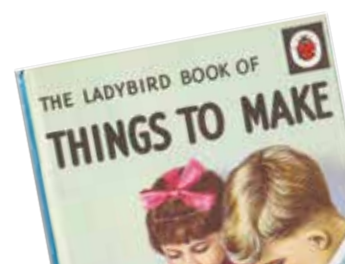
Ladybird Images

Upper Street Gallery, LCC, Elephant and Castle, SE1 6SB Mon-Sat 10am to 5pm (4pm on Saturdays) www.arts.ac.uk/lcc/events