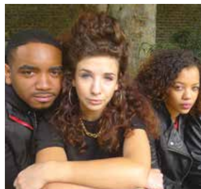
Future Theatre Company