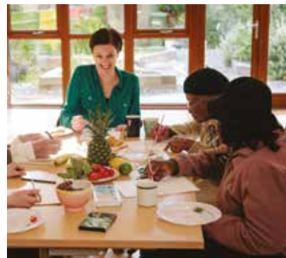
South London Cares

Funded to deliver an older people's physical and mental wellbeing programme, in partnership with London South Bank University.